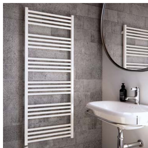
Radiator Shown: RAL9016