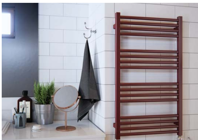
Radiator Shown: RAL3011

Colors shown above may vary from the actual color finishes due to printing or screen differences. In order to select the exact color that is required, please contact the ATC Technical Department to view the Special Color Palette. Contact sales@atc.ie for details on pricing and minimum order quantities.