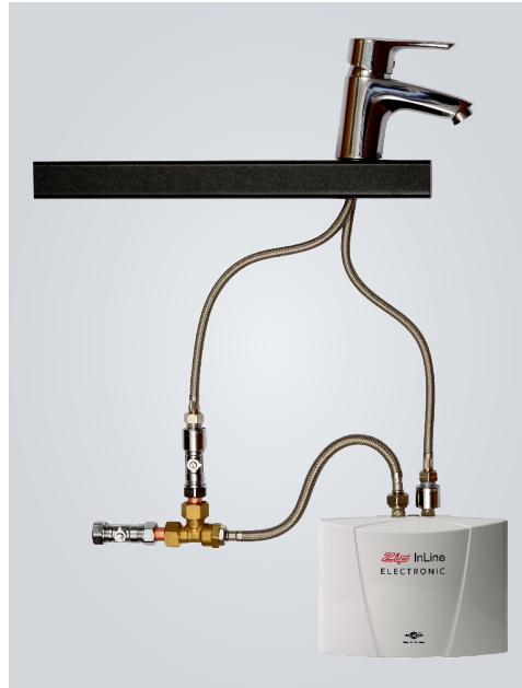
Mixer tap (MT) pack