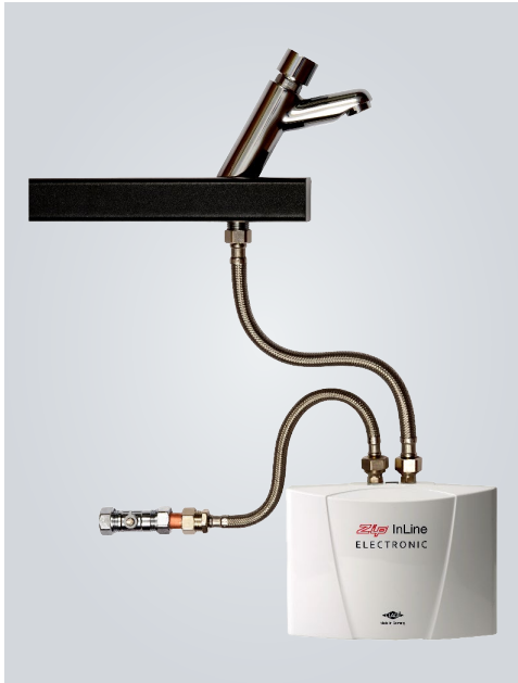
Non-convulsive tap (NC) pack